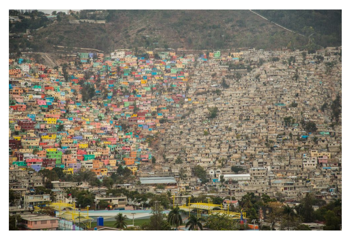
Figure 5: Jalouzi project in Port-au-Prince. (Thamon van Blokland, 2017).

The project in Jalouzi was initiated by the government and received a lot of criticism afterwards. Almost everyone, including the interviewed experts, believed the Jalouzi project was implemented to improve the view of the Oasis hotel, one of the only luxury hotels in Port-au-Prince, on the hill across from the Jalouzi neighborhood. The project was thought to only beautify the poverty that is underneath for foreign visitors. The project did nothing to combat the poverty in the neighborhood, the people were only given a bucket of paint and they were ordered to paint their houses. The project is viewed as a political project and because of the political instability in the country, this is not a positive development. There were concerns amongst the community that the Villa Rosa project was going to be similar to the one in Jalouzi. Charles (expert interview, May 30, 2017) said that a lot of people went up to her and asked her about the Jalouzi project. They wanted to know whether the project was going to be government led. One of the house-owners in Villa Rosa (resident interview, May 17, 2017) stated that: