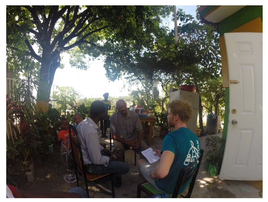
A resident of Villa Rosa whose house was not painted. But as he had a lot of experience as a painter, he was involved in the project since the beginning and did a lot of painting. His house was situated a couple of houses away from the project.

that this man was relatively wealthy compared to other residents in the neighborhood. Also I found out later on that people speculated that he put an extra floor on his house, just so it would block the view to the painted houses behind it. This to make sure his house got noticed and painted too. But this was just speculation.