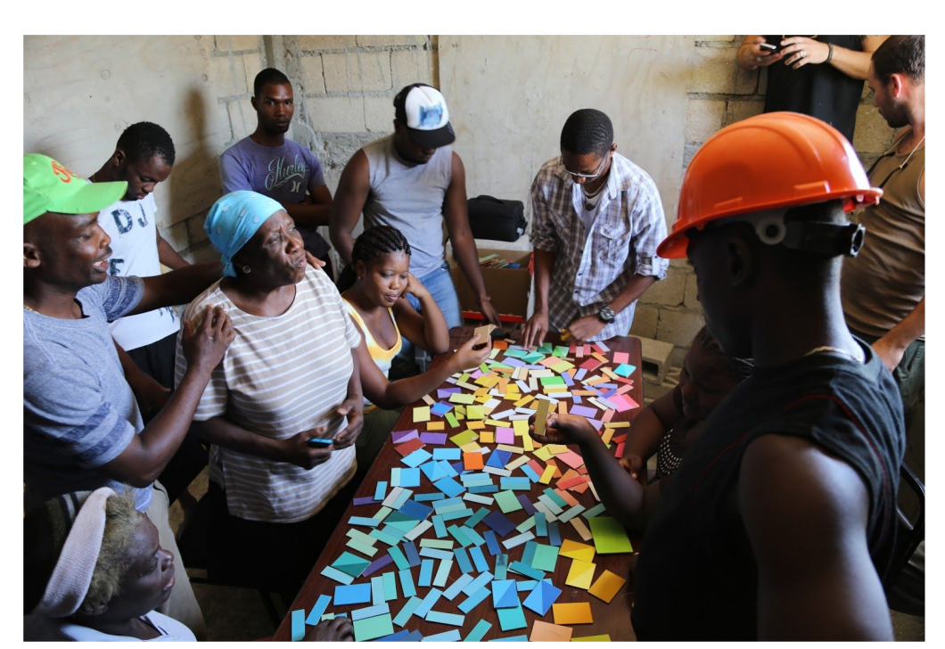
Figure 7: Color lab workshop in Villa Rosa (Favelapainting, 2015).

Together they decided on the official name of the project, Villa Rosa Tap Tap. According to the Casec (expert interview, April 8, 2017), the name 'Tap-Tap' represents movement as the Tap-Tap buses are associated with transportation. Same as the Tap-Tap buses, there is no clear destination, but it should lead to improvement, a better destination.