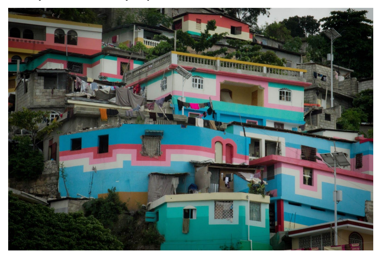
Figure 1: Detail of the painting project in Villa Rosa (Marc Nahum Leandre, 2016).

When Haiti is hit by a catastrophic earthquake with a magnitude of 7.0 in 2010, the devastation is not just physical, but also psychological. The capital, Port-au-Prince, is one of the areas that has been hit the heaviest. Despite foreign financial support and humanitarian relief, rebuilding the city turned out to be a slow process. Houses are reconstructed in a quick and simple matter, often leaving the outside brick walls unfinished. Five years after the earthquake, Dutch aid organization Cordaid invited the Favelapainting foundation, known for their large-scale community art projects, to visit Port-au-Prince and start up a painting project. The project was similar to the work that they had already done in Rio de Janeiro and Philadelphia – be it under completely different circumstances.