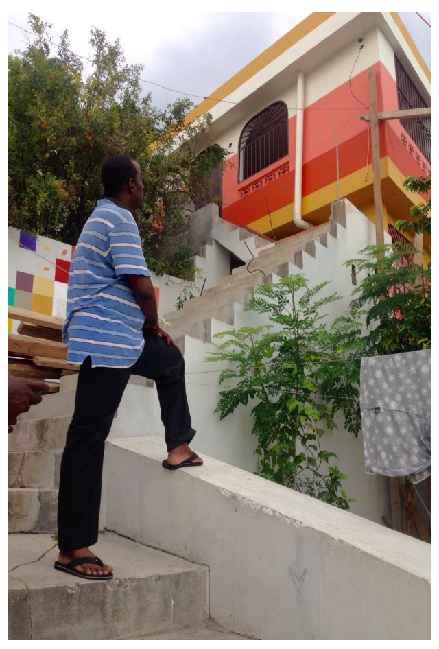
Figure 12: House-owner proud of his painted house (Daphnee Charles, 2016).

Overall, residents seemed to confirm the experts thoughts on their sense of pride. interviewed resident Almost every indicated that they felt proud when they walked through their neighborhood and that this feeling of pride was strengthened significantly due to the project. Most of them were satisfied with their neighborhood, but the project gave them an increased feeling of satisfaction. They indicated that this was mainly related to the design on the houses and how this influenced the visibility of community from the main road. Another aspect that contributes to their sense of pride is the quality of the infrastructural improvements. One of the residents