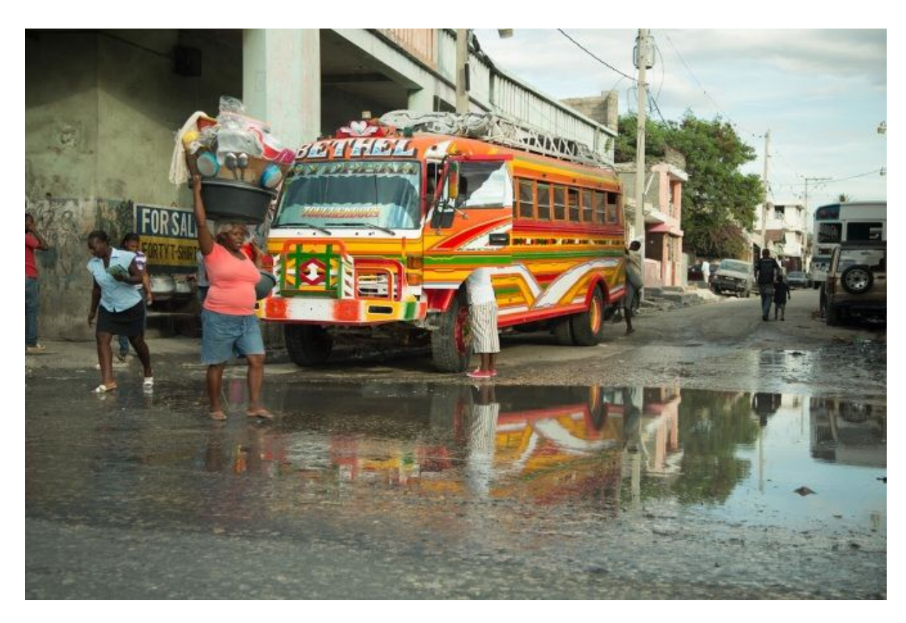
Figure 6: Tap-Tap bus in the streets of Port-au-Prince (Favelapainting, 2015).

Together they decided on the official name of the project, Villa Rosa Tap Tap. According to the Casec (expert interview, April 8, 2017), the name 'Tap-Tap' represents movement as the Tap-Tap buses are associated with transportation. Same as the Tap-Tap buses, there is no clear destination, but it should lead to improvement, a better destination.