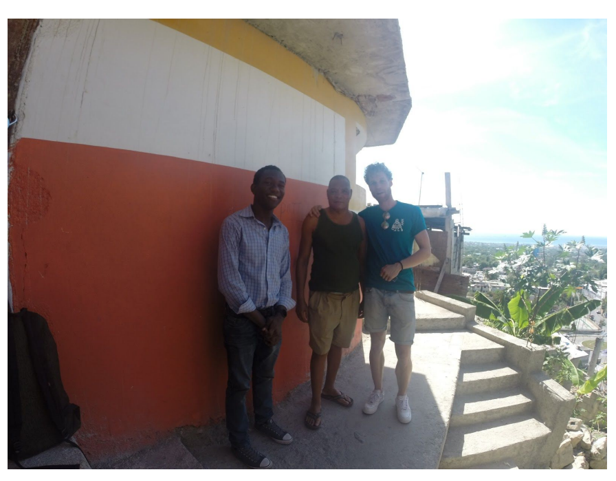
A resident of Villa Rosa whose house was not painted in the first two phases of the project. This man lived in a relatively big house right in between two houses that were painted in the second phase of the project. He was still in the process of constructing his house, but by the size of the house I judged

A resident of Villa Rosa whose house wasn't painted in the first two phases of the project. This woman lived in a relatively small house together with her two children and her mother. Her house was situated right next to some of the painted houses. I had the feeling that she assumed that I was also part of the project and that I was the one that could make the decision to paint her house in the third phase of the project. I tried to be as objective as possible, but in the end of the interview I had to explain this also and had to apologize that I'm not the one that makes this decision.