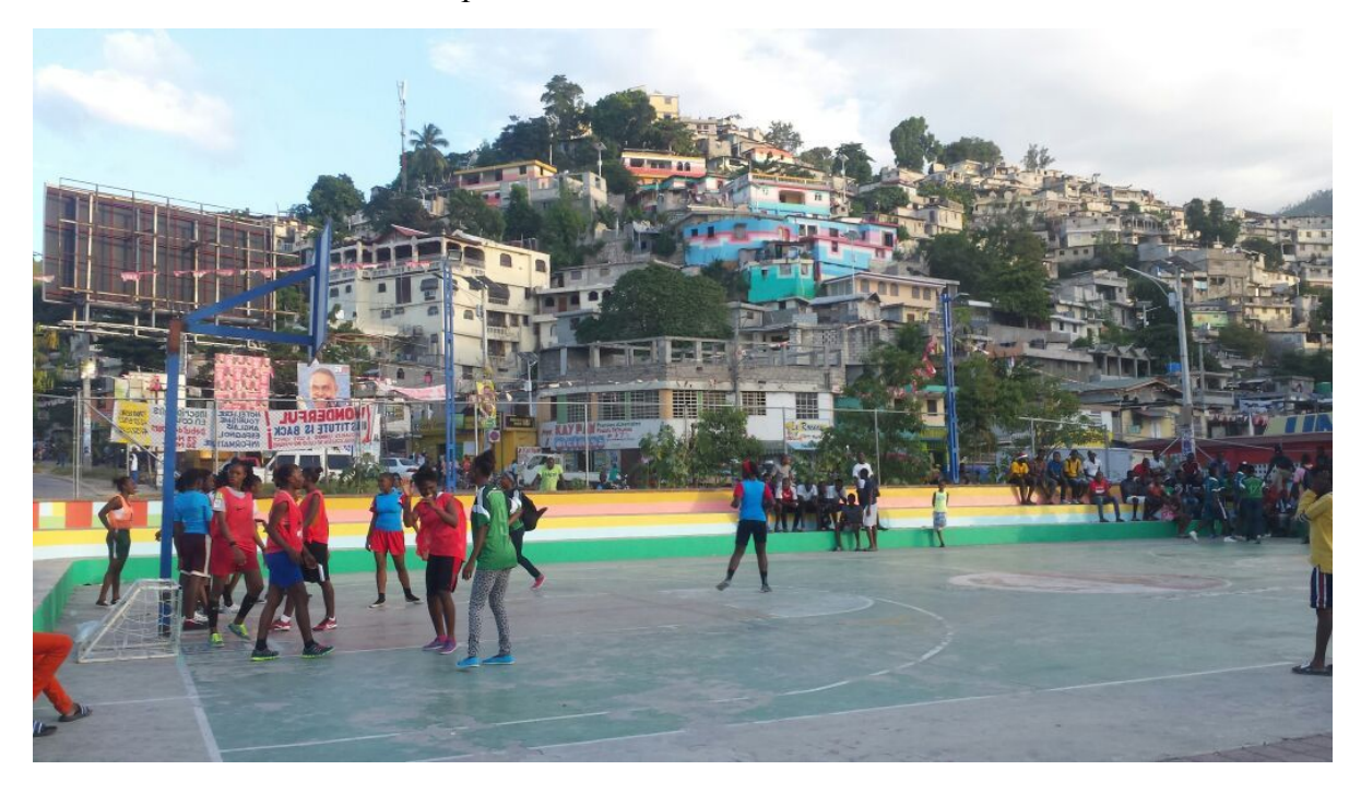
Figure 14: Public event organized by Cocread on Place Canape-Vert (Ralph Emmanuel François, 2016)

People were temporarily able to gain some revenues from the project. Cocread organized several events on the 'Place Canape-Vert', a public square downstairs of the community. Residents were offered to sell locally produced products such as food, jewels, t-shirts and sandals in order to make some profit.