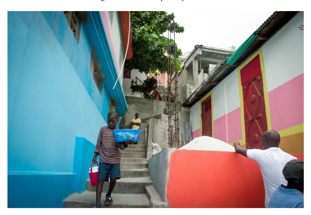
Figure 11: Children transporting water and food into the community (Marc Nahum Leandre, 2016).

The three major problems in the neighborhood that were often mentioned by both residents and experts were all related to the lack of basic services. The Casec (expert interview, April 8, 2017) mentioned waste management as one of the biggest problem. According to him, this problem was related to the overall lack of waste management and garbage disposal in Haitian society. The lack of waste management was also discussed by residents, but remarkably this was only mentioned by house-owners whose house wasn't painted. Field observations confirmed that there was hardly any waste around the painted houses. The further from the painted area, the more waste was found. The other two problems related to water and electricity. As for now, the residents have no running water and steady electricity. Both these basic services have not changed in the last couple of years.