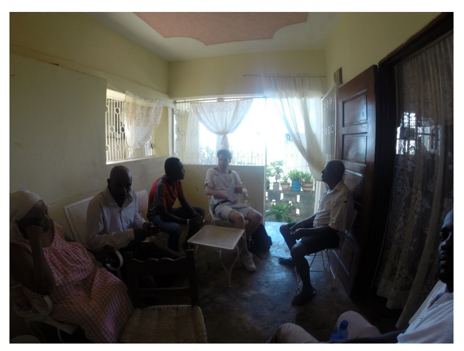
Residents of Villa Rosa. When we entered their house, we were supposed to do the interview with the owner of the house, but a friend of him was also visiting at the same time. As this man also lived in Villa Rosa and because they were both members of the community platform in Villa Rosa we choose to do the interview with the both of them.