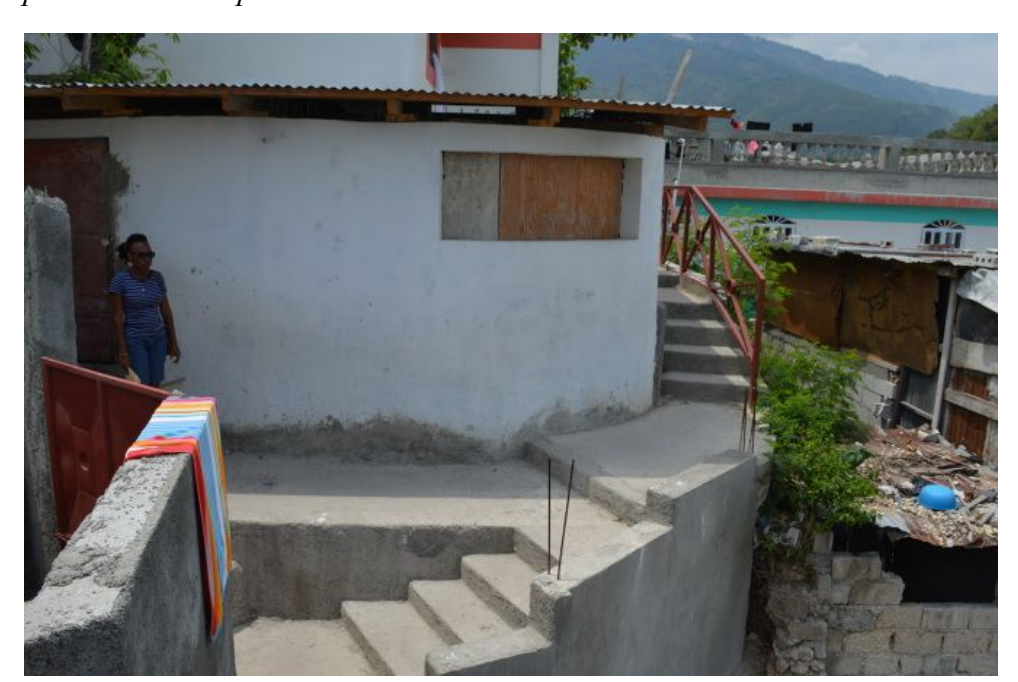
Figure 10: Improved accessibility in Villa Rosa (Thamon van Blokland, 2017).

"The roads have changed significantly, before when there was water on the roads you couldn't walk. Now the drainage is fixed and is no more water in the streets. The road is fixed, we can easily walk now, while before people got hurt. And also the stairs are constructed professionally, they have many levels and you can walk easily now. And also before they painted the houses they made sure to plaster them, so the houses were not only painted but also plastered."