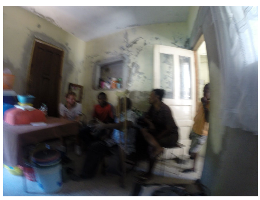
A resident of Villa Rosa. He was an older guy, probably around 60/70 years old and he lived in a house downstairs of the community. Close to some of the painted houses that were situated lower in